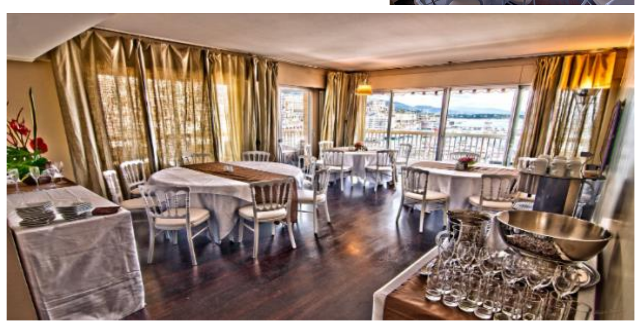
Les tarifs donnés sont sujets à changement selon la politique fiscale des pays et le nombre de participants.